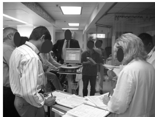
Figure 2: Multiple artifacts observed in rounds

Despite the dominant mode of verbal communication, the importance of artifacts as contributors or recorders of information cannot be overlooked. In this context, we defined artifacts to be tangible devices or tools which supported the information exchange such as computers and paper-based tools (see Figure 2).